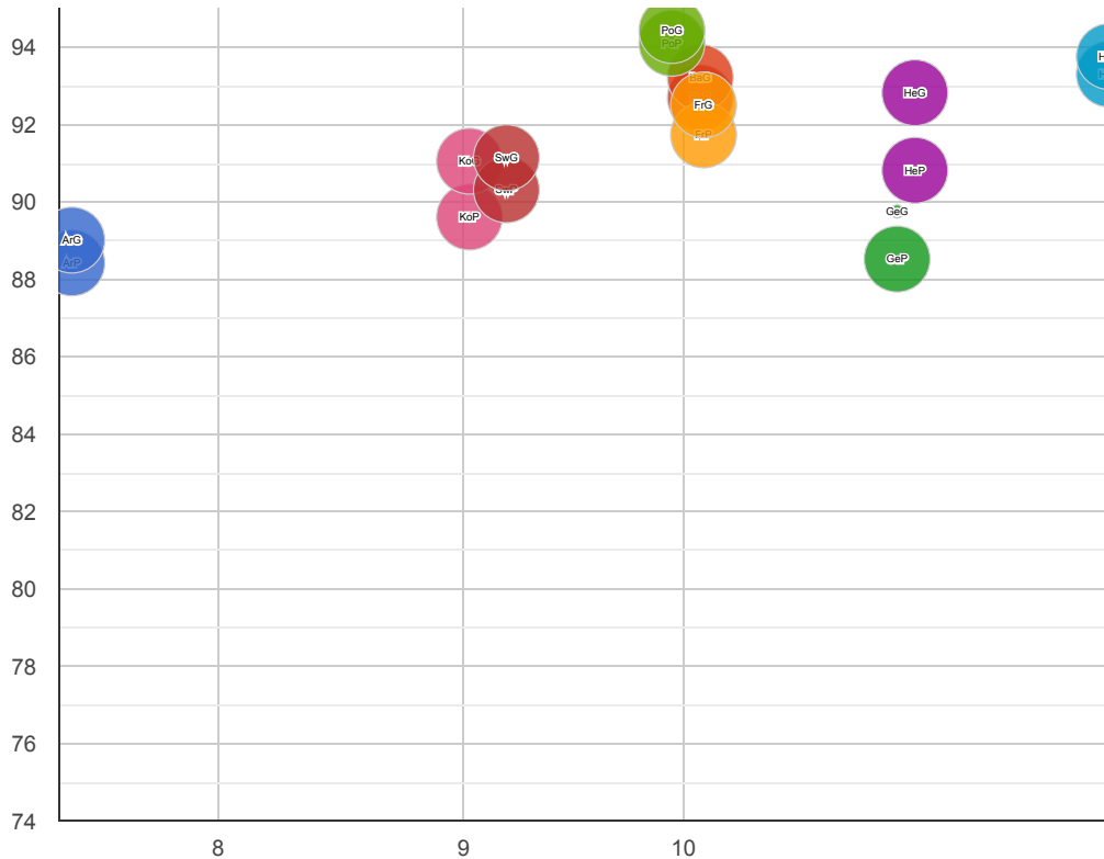
Figure 4: The correlation between the non terminals per sentence ratio and Leaf Accuracy (macro) scores. x : \#non\ terminal / \#sentence ; y : Acc.(%)

compare the performance across annotation schemes, assuming that those subsets are representative of their original source. 42