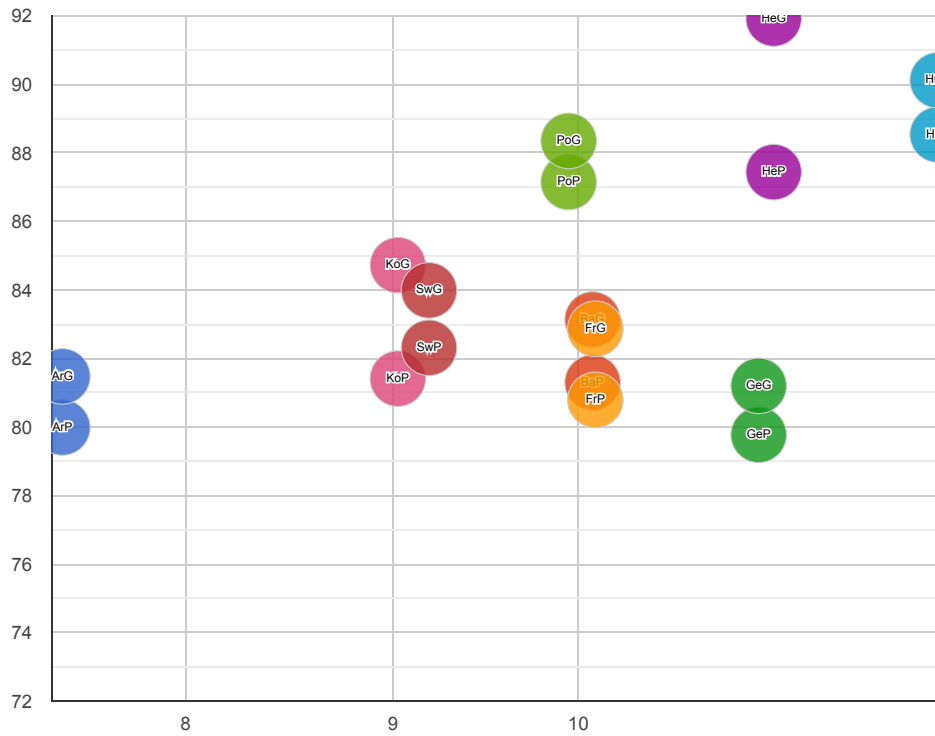
Figure 3: The correlation between the non terminals per sentence ratio and F-scores. x : #non terminal / #sentence ; y : F1 (%)