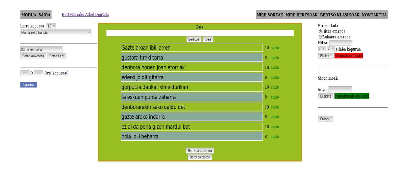
Figure 1: A verse written in the BAD web application.