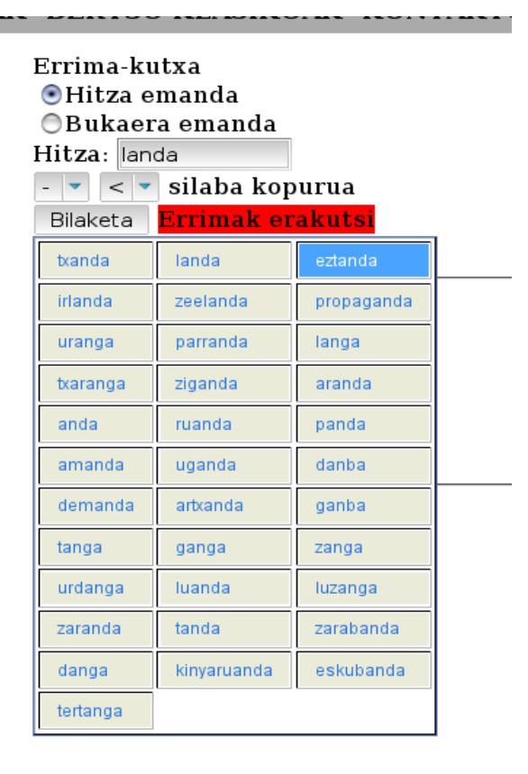
Figure 2: The response of the rhyme search engine.

set of words that can be filtered depending on the number of syllables required. Among this list of words, we can find some words that end in anda , such as, Irlanda (Ireland) or eztanda (explosion), but through the application of phonological equivalency rules we also find terms like ganga (vault).